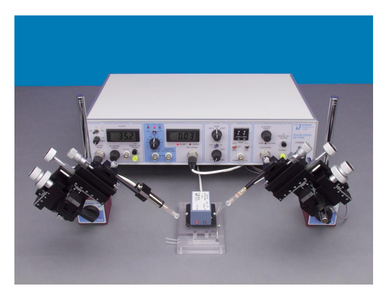
Figure 2: Voltage Clamp Apparatus Two Electrode Voltage Clamp Apparatus. From https://www.warneronline.com/product_info.cfm?name=TEV-700+Two+Electrode +Voltage+Clamp+Workstation&id=170.

and error nature of the process and crucially, its temporality. It is not only a matter of models, simulations, and experiments becoming hooked up into a system, but of modellers, simulators, experimenters. The following is an example of how this hooking up occurs. In cardiac electrophysiology, modellers and simulators are setting up collaborations with clinicians that will allow them to explore drug actions in a complementary way – that is, beginning to establish MSE-systems that will work across the academia / clinic boundary. As in academic laboratories, a typical methodology for clinicians in this domain are voltage clamp experiments, that control the flow of conductances across the ion channels of the cell membrane. Voltage experiments typically involve the kind of apparatus shown in Figure 2. Computational modelling and simulation instead typically involve apparatus such as PCs, software packages such as Fortran. simulations packages such as CHASTE Matlab. (http://www.cs.ox.ac.uk/chaste/); mark up software such as CellML, and depending on the complexity of the simulation, supercomputing resources. Just by the apparatus involved, it is clear that there is a huge difference in the research activities that the different people in this area undertake on a daily basis.