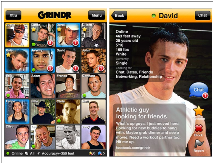
Figure 1. Screenshots from Grindr's iPhone app: (Left) List of profiles showing online gay men sorted by proximity. (Right) Sample user profile.

hookup sites like ManHunt 4 and Adam4Adam 5 ) echo techniques that gay men have long used to meet each other, including book and pen pal clubs, as well as travel guides that identified gay-affirmative spaces dating back to the 1940s (Meeker, 2006).